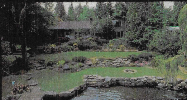
HUNTS POINT ESTATE This private estate near the tip of Hunts Point combines a carefully landscaped acre, a 5,000 square foot home and moorage for yachts in excess of 60 feet. For private showing, call Bob Laswell 236-1136 or Coral Acton 828-6857.