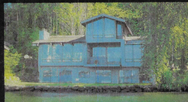
WATERFRONT PRICE DROP. You cannot find a better value...four years old, 3,870 square feet, four bedrooms, four baths, 93 feet of waterfront, on the north end of Mercer Island for only $495,000. This is a buy...don't miss out. The Heller Co., Realtors 454-7299.