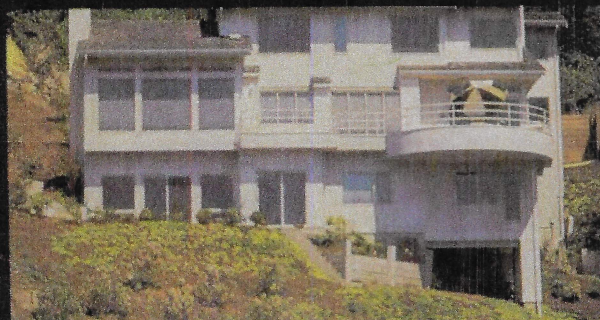
DEVELOPER'S OWN HOME. Indescribably beautiful, this two year old contemporary enjoys a sensational 180 degree southwest view and 78 ft of level waterfront. Virtually unlimited elegance and every conceivable amenity including rounded interior walls, imported tiles and marble. $695,000. Call Coral Acton 828-6857 or Bob Laswell 236-1136.