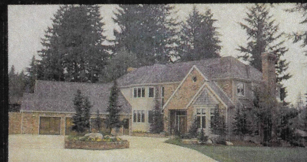
"THE CLASSIC-1984 STREET OF DREAMS." This four bedroom home-award winner for best master suite and best kitchen design is on a gorgeous view lot at Brookside Country Club! 1,500 square feet of decking. Sumptuous master. $425,000. The Heller Co., Realtors 454-7299.